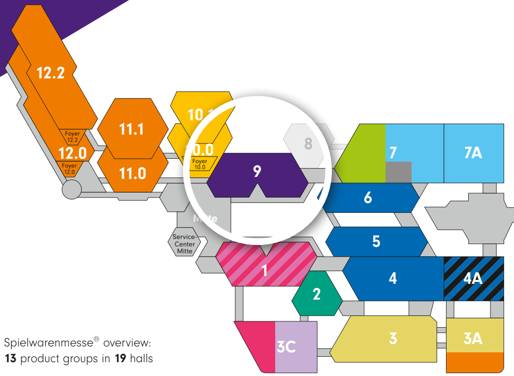
Spielwarenmesse® overview: 13 product groups in 19 halls