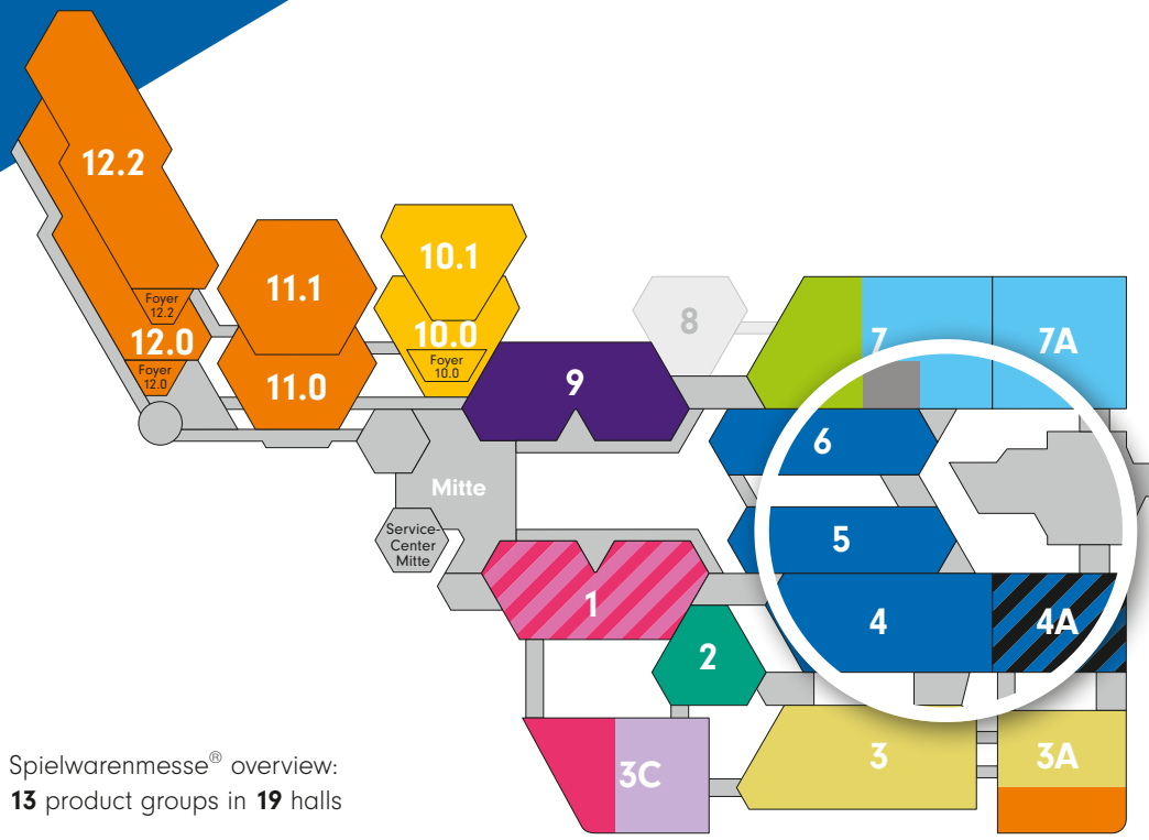
Spielwarenmesse® overview: 13 product groups in 19 halls